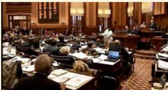
“Direct Access to the legislative branch”

In 2011 WV Governor Earl Ray Tomblin by Executive order No.-511 created the GACSA.